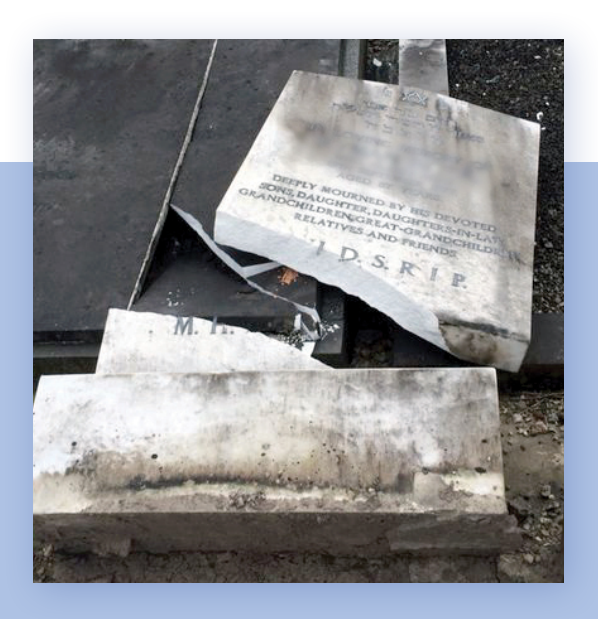
Damaged gravestone at Blackley Cemetery, Manchester, June 2014

There were 27 incidents of Damage & Desecration of Jewish property recorded by CST in the first six months of 2014, an increase of 35 per cent from the 20 incidents of this type recorded in the first half of 2013. There were 29 incidents recorded in this category in the first six months of 2012 and 35 during the same period in 2011.