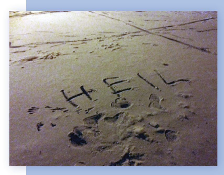
As shown on cover: a swastika and the word "Heil" drawn in snow in a synagogue car park, Greater Manchester, January 2013

Antisemitic incidents are reported to CST in a number of ways, most commonly by telephone, email, via the CST website or via CST's social media profiles. Incidents can be reported to CST by the victim, a witness, or by somebody acting on their behalf. In 2001, CST was accorded third-party reporting status by the Police.