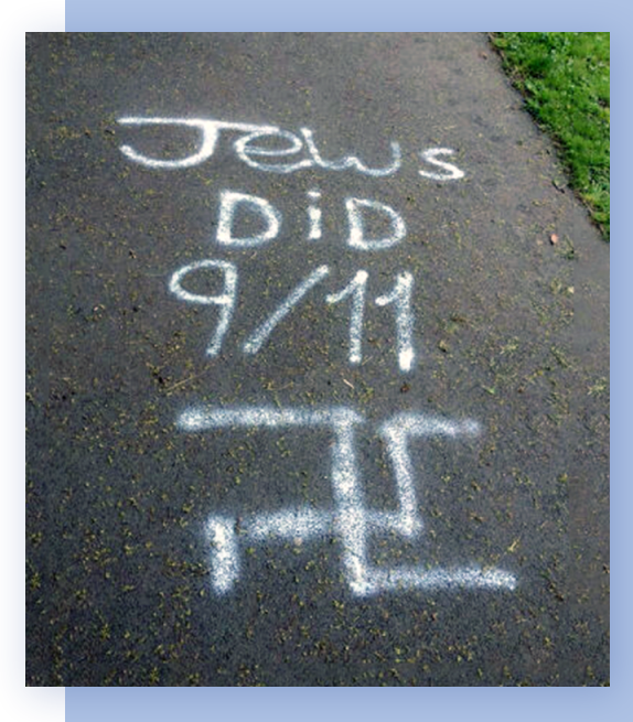
Graffiti in a park in Greater London, May 2013

For comparison, in the first six months of 2012, 132 of the 311 antisemitic incidents reported to CST involved the use of political discourse alongside the antisemitism, of which 89 used far right discourse; 33 made reference to Israel, Zionism or the Middle East; and 10 involved Islamist discourse. In 18 of these incidents, more than one type of discourse was used. During the same period, there were 94 antisemitic incidents that showed evidence of political motivation, of which 74 showed evidence of far right motivation; 15 showed evidence of anti-Zionist motivation; and five showed evidence of Islamist motivation.