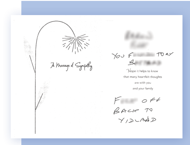
Antisemitic card sent to a Jewish Parliamentarian, London, January 2013

CST received a description of the approximate age of the victim or victims in 87 of the antisemitic incidents reported during the first six months of 2013. Of these, 66, or 76 per cent, involved adult victims; 15, or 17 per cent, involved victims who were minors; and in six incidents the victims were mixed groups of adults and minors.