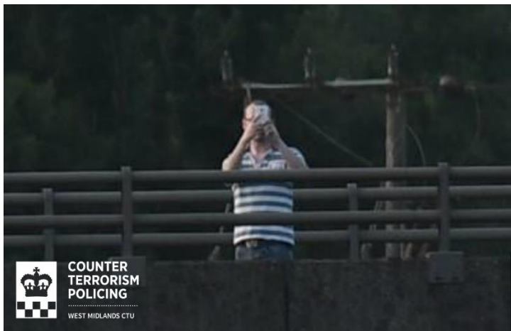
Lewin carries out reconnaissance on

Reporting won't ruin lives, but it could save them. Action Counters Terrorism. Remember, in an emergency, always dial 999.