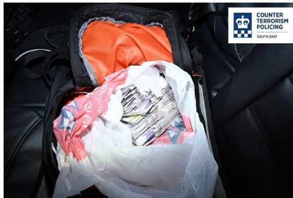
Cash found in a rucksack upon Little's arrest

Between 27 July and 7 August 2022, Little downloaded extremist Islamic material and the day before his arrest viewed YouTube videos primarily concerned with firearms and Jihad.