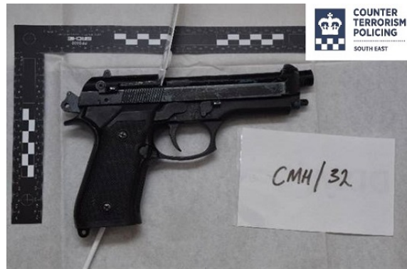
The gun intended for Little

"The sentence today reflects the seriousness of this offending, and the CPS remains firmly committed to prosecuting all forms of terrorism in England and Wales."